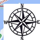
ADDENDUM A.2: Course Diagram